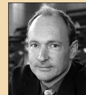
Tim Berners-Lee is the director of the World Wide Web Consortium, a senior researcher at the Massachusetts Institute of Technology's Computer Science and Artificial Intelligence Laboratory, and a professor of computer science in the Department of Electronics and Computer Science at Southampton University. Contact him at timbl@w3.org .